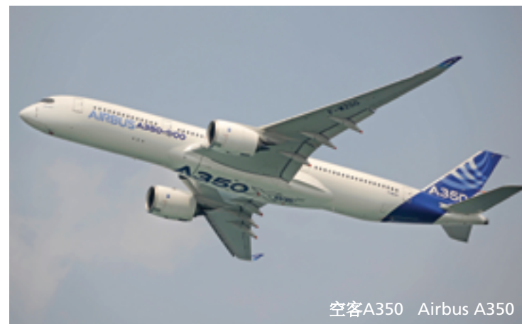
空客A350 Airbus A350

Airbus's ACJ350, which offers 2,900 square feet of cabin space, will be capable of speeds up to Mach 0.89. Its 10,050-nautical-mile range will provide for nonstop connections between cities as far apart as New York and Beijing. No price has been announced, but the A350-800 airline variant sells for about $245 million. Airbus claims to have sold two ACJ350s and expects the model to enter airline service this year.