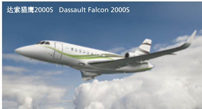
达索猎鹰2000S Dassault Falcon 2000S

达索航空新的研发项目为猎鹰5X，该机为宽体机身，安装了一种新型机翼，机翼带有扰流板、减速板和新型襟副翼，这种机翼有助于高速侧滚控制和低速增升。电传操纵系统5X将成为下一代猎鹰喷气机的设计基准，达索将推出一种更大的猎鹰喷气机，与庞巴迪和湾流的超远程喷气机争夺市场份额。