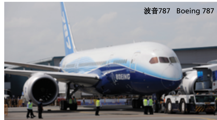
波音787 Boeing 787