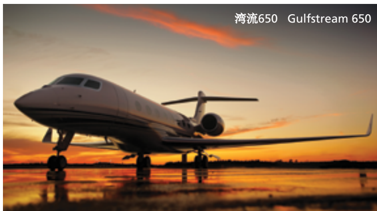
湾流650 Gulfstream 650

The shorter Legacy 450 also accommodates eight passengers and has a maximum cruise speed of Mach 0.82 but less range—2,300 nautical miles. The price tag also is lower, at $16.47 million. Embraer anticipates entry into service in the first half of 2015.