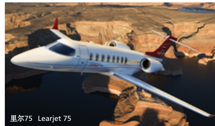
里尔75 Learjet 75

In the meantime, plans are proceeding for the debut of the latest members of the Global family—the Global 7000 and 8000. The 7000, with a $68.9 million price tag, will have a four-zone cabin, travel at Mach 0.90 and have a range of 7,300 nautical miles. Bombardier expects it to enter service in 2016. The 8000, with a three-zone cabin, will enter service a year later. With a $66.2 million price, it promises a range of 7,000 nautical miles and a cruise speed of Mach 0.85.