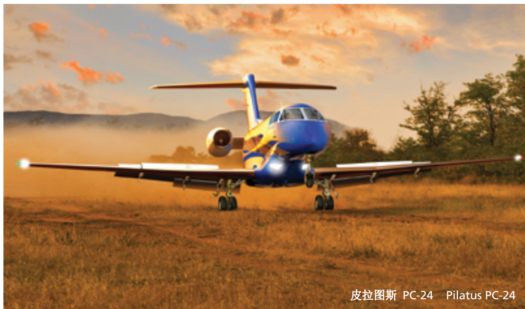
皮拉图斯 PC-24 Pilatus PC-24

单发涡轮螺旋桨飞机PC-12NG一向是公务机市场的宠儿，该机的瑞士制造商皮拉图斯最近公布了一直保密的双发喷气机PC-24的研发计划。PC-24虽为轻型喷气机，却拥有媲美中型喷气机的宽大机舱和一个超大的货舱门。该机为全金属机身，在少于3000英尺长度的跑道上也可起飞，最大巡航速度可达425海里/小时，搭载4名乘客时，使用备份油量航程可达1950海里。该机配备一名飞行员，售价为890万美元，计划于2017年投入运营。