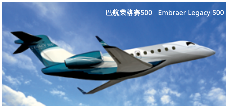
巴航莱格赛500 Embraer Legacy 500

Gulfstream's much-talked-about G650—currently the fastest business jet available—and its smaller brother, the G280, were certified last September. As of press time, no news had been released about additional models in the works.