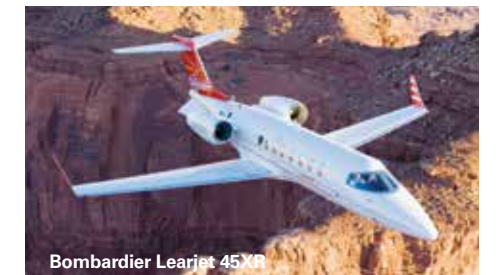
Bombardier Learjet 45XR