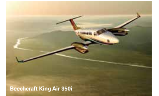
Beechcraft King Air 350i