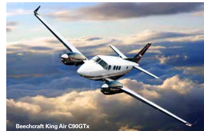
Beechcraft King Air C90GTx