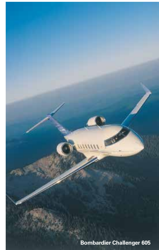
Bombardier Challenger 605