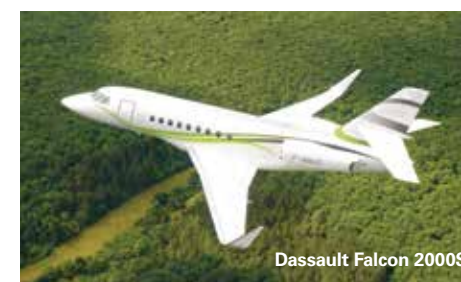
Dassault Falcon 2000S