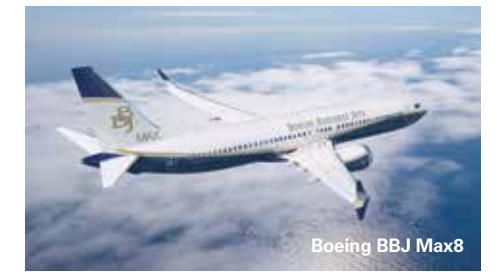
Boeing BBJ Max8