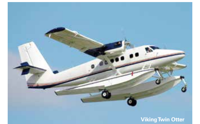
Viking Twin Otter