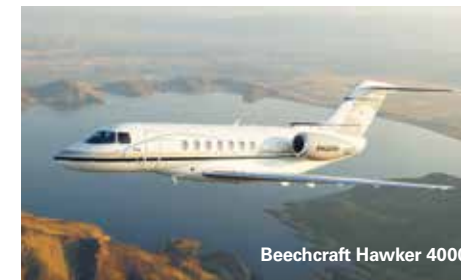
Beechcraft Hawker 4000