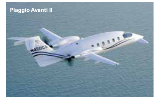
Piaggio Avanti II