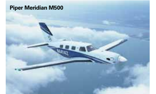
Piper Meridian M500