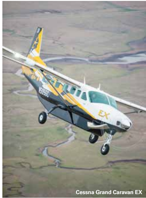
Cessna Grand Caravan EX