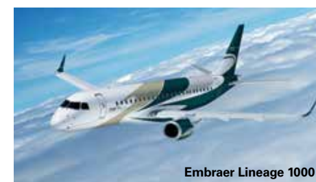
Embraer Lineage 1000