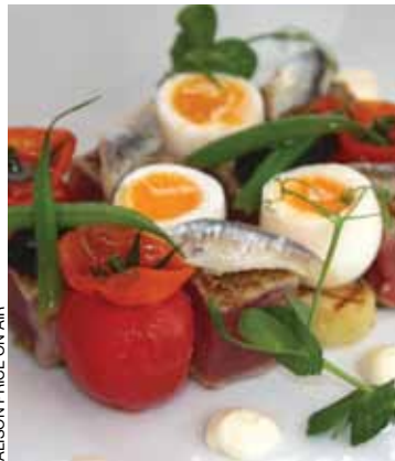
ALISON PRICE ON AIR

Gourmet AirFare Belleville (866) 538-3663 gourmetairfare.com orders@gourmetairfare.com