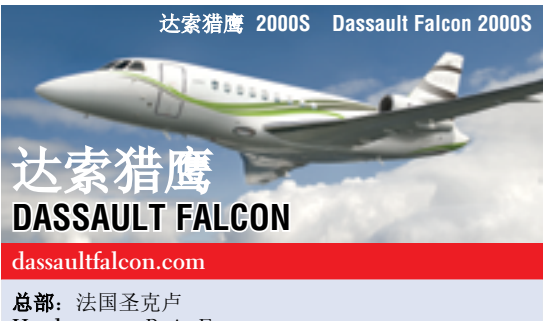
达索猎鹰 DASSAULT FALCON

MD直升机公司 美国亚利桑那州Mesa MD Helicopters Mesa, Arizona mdhelicopters.com