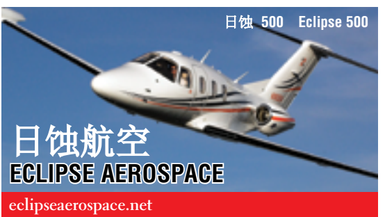
日蚀航空 ECLIPSE AEROSPACE

Dassault Industries, EADS and a group of private investors own Dassault Aviation, whose marketing and support subsidiary in the U.S. is Dassault Falcon Jet. The company builds airframes at its factory in southwest France. Dassault offers the Falcon 900 and 2000 family of business jets, as well as the Falcon 7X trijet, featuring the latest in fly-by-wire flight-control technology and fighter-jet-style sidesticks in the cockpit. The next Falcon—the fly-by-wire 5X—is a twin-engine widebody jet, with service entry scheduled for 2017. Last year, the 2000LXS entered service, replacing the 2000LX.