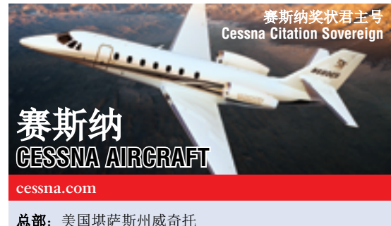
赛斯纳 CESSNA AIRCRAFT

Daher-Socata's speedy single-engine turboprop TBM 850 cruises at 320 knots as high as 31,000 feet while carrying up to six occupants. Range at top speed is more than 1,400 nautical miles with reserves or nearly 1,600 nautical miles at the 252-knot long-range cruise speed, yet the TBM 850 can land on runways as short as 2,100 feet. Industrial conglomerate Daher, which celebrated its 150th anniversary in 2013, purchased Socata in 2009.