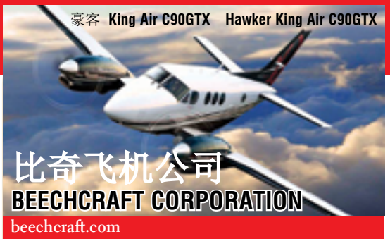
比奇飞机公司 BEECHCRAFT CORPORATION

Airbus entered the bizliner market in 1997 with the Airbus Corporate Jet (ACJ), an executive version of its A319 airliner. The company's three single-aisle bizliners are now named the ACJ318, ACJ319 and ACJ320. Airbus Corporate Jets plans to offer the “new-engine option” (neo) for the ACJ319 and ACJ320 beginning in 2018. For government and other customers requiring the ultimate in space and long-distance capability, Airbus also produces executive versions of its A330, A340, A350 and A380 widebody jetliners.