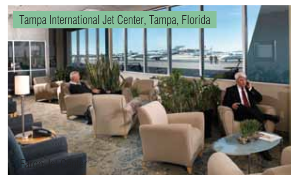
Tampa International Jet Center, Tampa, Florida

AIN asked its subscribers to consider four criteria: line service, passenger amenities, pilot amenities and facilities. For each of these, readers scored FBOs from 1 to 10, with 10 being the highest. AIN then compiled those scores to calculate an average for each location that received 20 or more individual ratings.