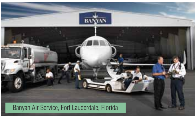
Banyan Air Service, Fort Lauderdale, Florida