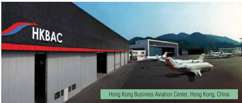
Hong Kong Business Aviation Center, Hong Kong, China