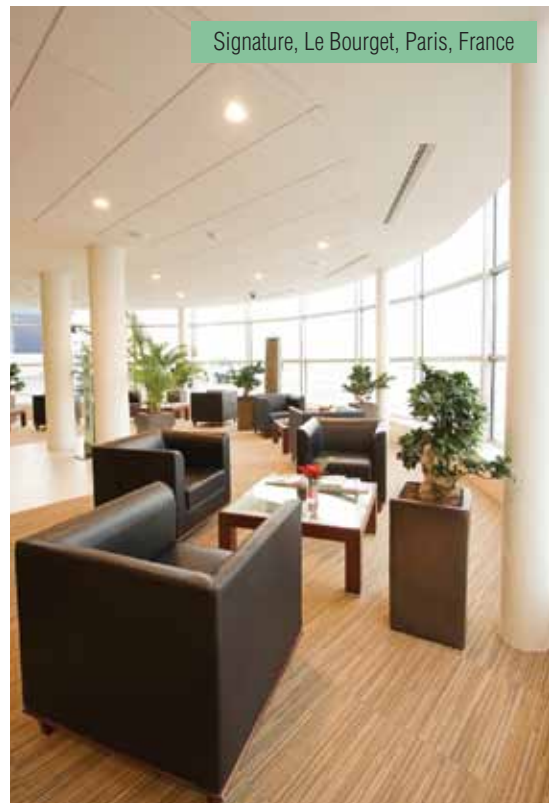
Signature, Le Bourget, Paris, France