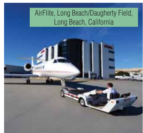
AirFlite, Long Beach/Daugherty Field, Long Beach, California

are all in Europe. These include TAG Aviation at Farnborough Airport, an hour outside London, which had the highest overall score among international locations. The company this year is celebrating a decade of operating the airport (one of the few in Europe dedicated to business aviation), which it took over from the UK Ministry of Defence in 2003. Easily identified by its pair of visually striking three-bay hangars providing 240,000 square feet of aircraft storage, maintenance facilities and offices, the FBO offers dedicated concierge service as well as onsite customs and immigration facilities. Customers are permitted to drive directly to their aircraft, if they wish to bypass the well-appointed terminal, which includes passenger and crew lounges and multimedia-equipped conference rooms.