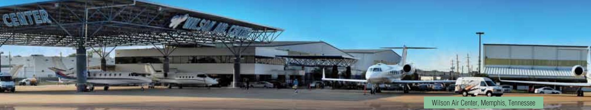
Wilson Air Center, Memphis, Tennessee