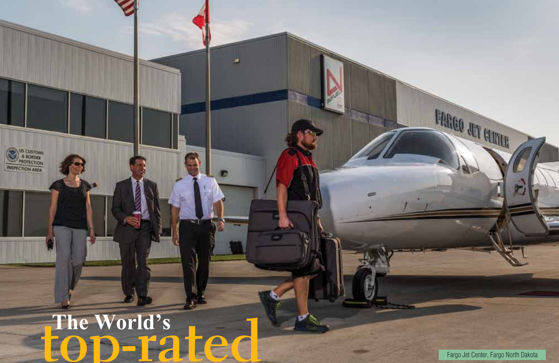
Fargo Jet Center, Fargo North Dakota