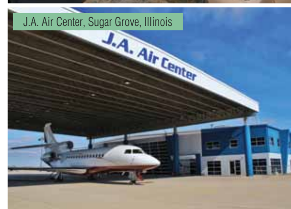
J.A. Air Center, Sugar Grove, Illinois